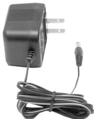
(Adapter) 115V: SP-115 230V: SP-230